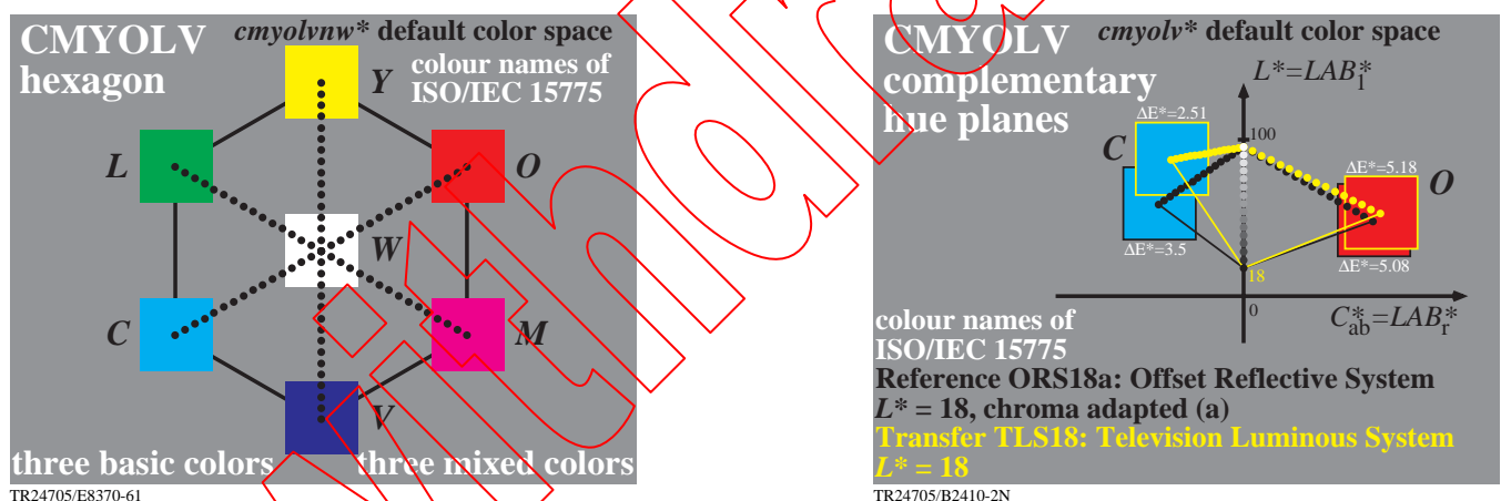
Figure 0-1: Equal relative CIELAB spacing of 16 steps for different hue and lightness

This Technical Report is based on analog and digital ISO/IEC-test charts. The analog ISO/IEC-test charts are equally spaced in CIELAB between white W and the six colours CMYOLV and black N.